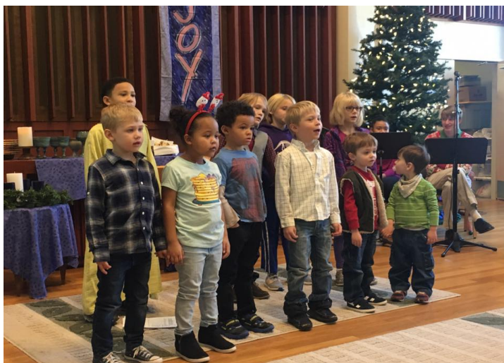
A choir of young angels sang at the SH Children's Pageant