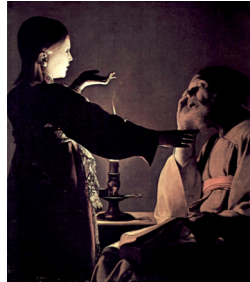
Angel Appears to Joseph, by Georges La Tour, 1593-1652.

First Christian Church (Disciples of Christ), Minneapolis, is a partner church at SpringHouse Ministry Center