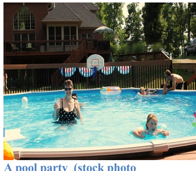
A pool party (stock photo)

(sloppy joes, beans, buns, veggie tray!) and drinks (frozen margaritas!) and dessert (sorbets!). You bring additional items if you wish, like chips?