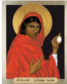
Mary Magdalene image

Texts for the July-August series "May Voices, One Body" have been submitted by FCC members, some old favorites and some meant to challenge the pastors and the listeners.