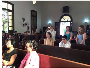
Brothers and sisters of Christ in Paraguay